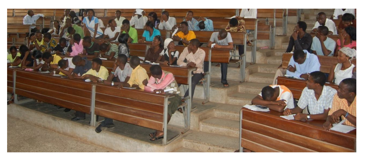
Students' Attitudes Towards English Language Learning Before Improvisation