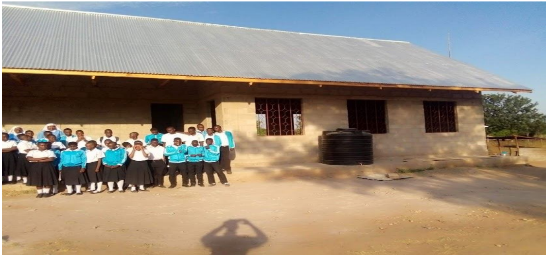
Fig. 3: Physics and chemistry laboratories right in the photo