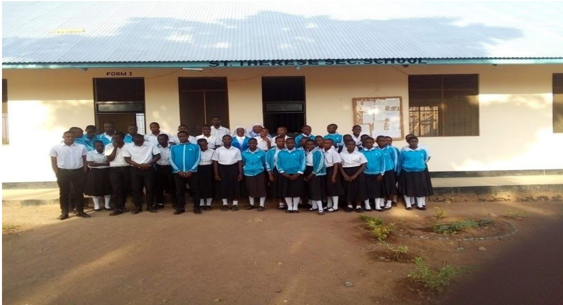
Fig. 2: The sisters with the newly enrolled students in the new school