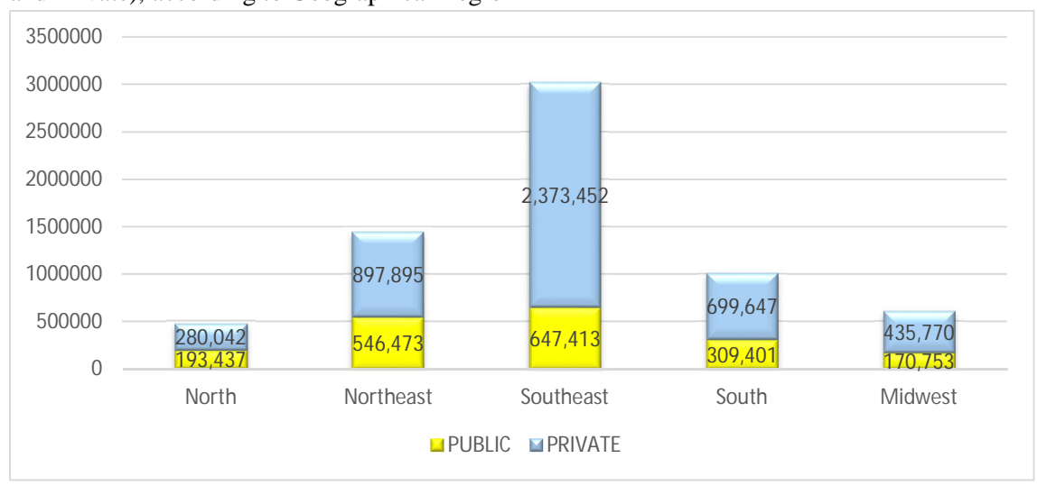
Figure 4. Number of Undergraduate Face-to-face Enrollment Classes by Administrative Category (Public and Private), according to Geographical Region