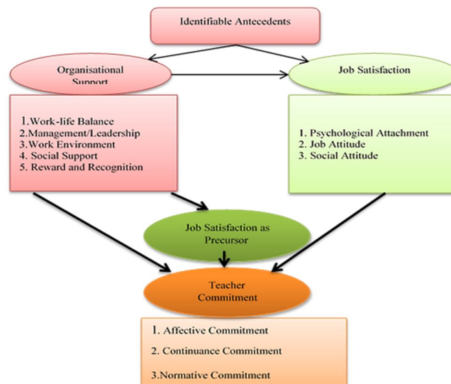
Figure 2: Theoretical Model: Organisation Support and Job Satisfaction Model for Teacher Commitment in a College of Education

In answering the primary research question, the study applies the content and thematic analysis to the wealth of theories, empirical studies, components and antecedents. It was found that organisational support, job satisfaction and teacher commitments are multidimensional constructs rather than single concepts. The document review revealed that organisational support might be modelled from five constructs. These include work-life balance, management/leadership, work environment, social support and reward and recognition. It was also found from the documentary review that job satisfaction can be operationalised from three constructs. These are job attitude, social attitude and psychological attitude. These were modelled from lessons learnt from Hulin & Judge (2003). These evidence from the literature and the understanding of each of these variables, their constructs, antecedents and how they are interrelated are used in this study in developing a comprehensive model relevant to colleges of education.