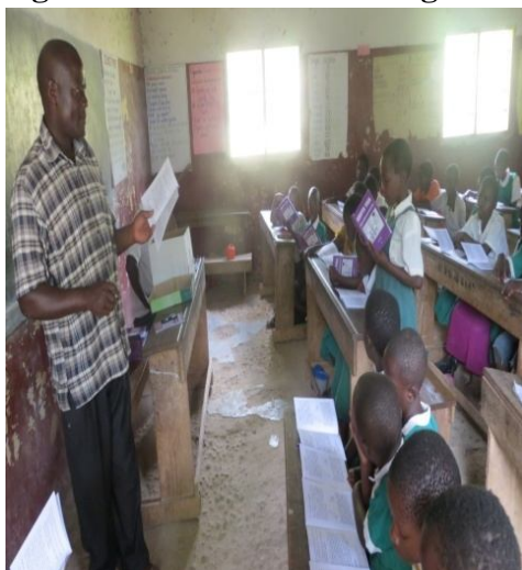
Figure 2: One of the Reading Lessons from Omuto Yiga (Babirye, 2011)

Both teachers from UPS and one teacher from SUPS had pre-set questions for pupils to answer after reading the story. Those from RPS and one from SUPS randomly asked questions from the story as they wished. As a result, teachers who had pre-set questions were better prepared and their questions flowed chronologically from the beginning to the end of the story unlike the questions of their counterparts which were randomly set from various parts of the story. All teachers motivated their pupils as they answered the questions. The motivation encouraged pupils to be active throughout the lesson.