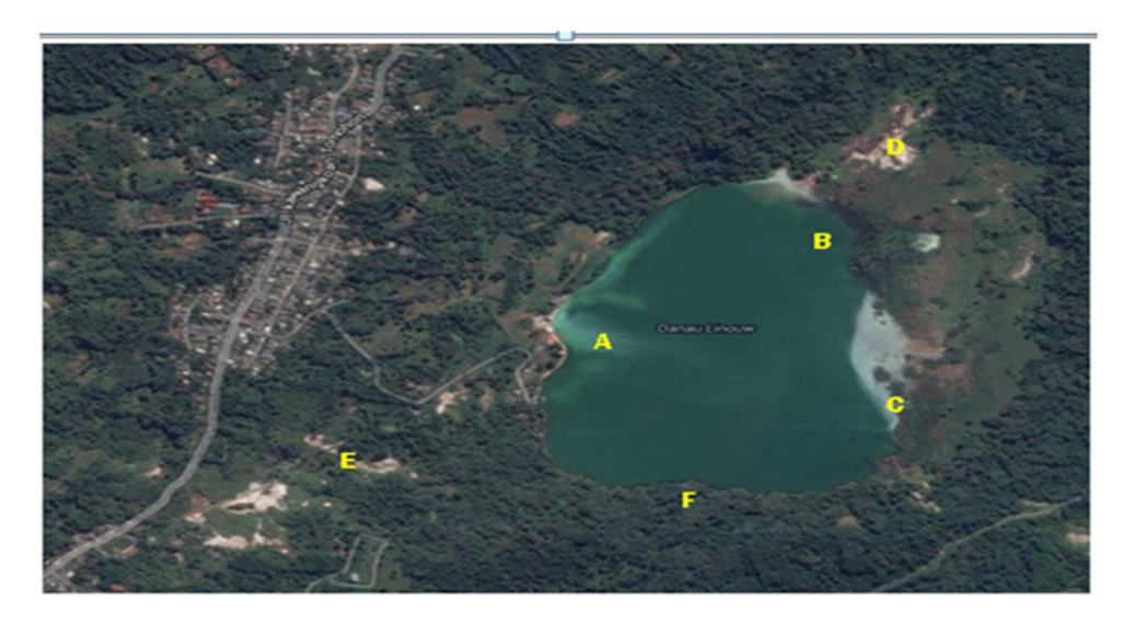
Figure 2. Map of the Zoning lake Linow

Linow lake geothermal area maps presented in Figure 2. Linawlake is famous lake changes color, from noon until late pagim. this is related to the elevation of the sun associated with the reflection of radiation by the lake water containing sulfur and other chemicals that vary (spatial) is quite high. The identification and measurement in the field, shows the six characteristics of the geothermal manifestations and spatial changes that can be developed for field activities. The results of the identification of the location of field activities (observation measurement, research) at the lakeLinow presented in Table-1.