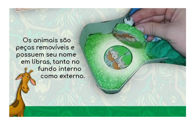
Figure 3 shows one example of the platform, the Libras sign and the matching home:

Figure 2 shows the zoo and each animal in its place. The text in Portuguese says: "my first animals - a project for Deaf children to have fun e learn. The zoo has twelve animals". Each animal is in its own environment, mounted on a shape fitting platform. Beneath each platform, and on the board, there is a Libras sign for that animal. The game is played by showing the child the animals, and teaching her the Libras sign. Some additional knowledge may be presented. Then the child is encouraged to find the home of the animal, that is, the one that matches the Libras sign and the shape.