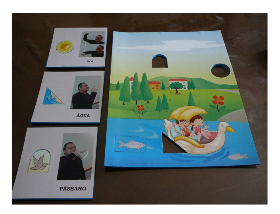
Figure 5 - The park and the cards: the bird, the water and the sun

The mother helps the Deaf child to recognise the elements, their placements on the board, their relations with each other. This time the mother should help the child to create a narrative. Then, by matching the shapes, both mother and child find the Libras in the cards. The zoo and the park are part of the daily lives of Deaf children. The games allow for meaningful interaction and learning. Not all the elements on the board have a corresponding place in the zoo or sign in the cards for the park: this invites the children to ask about the other elements and their relations. This curiosity motivates the child, and promotes interactions with the mother. The choice of elements were made in a way that there would be a relation (e.g. the fish lives in the water; the bird flies etc.). This way allows the Deaf child to create her own signification of the proposed environment. There are a lot of others aspects that can be explored in each game: colours, size, other elements (e.g. the trees).