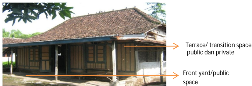
Figure 2 : The transition space of horizontal housing merges with the public space.

A different personalization condition appears in vertical housing. The user's satisfaction does not only depend on their individual unit, but more on the physical and social environment (Francescato et al, 1987). The satisfaction within vertical housing is related to the sense of togetherness. Explained in Tim Cho's (2007) research stating that to create a culture based vertical housing concept, emphasizes on the need of community space for togetherness. Community space a social environment aspect is used by sharing, which the uses are defined by the management. Raman (2010) stated that social relation within high rise building user are very low, because social interaction mostly occur in the same floor level users. Acquaintanceship among the same floor users a bigger than among different floors/blocks. This occurs in different types of corridor (Aziz, 2013). Hashim dan Rahim (2010) researched that the weakness of privacy concept in modern buildings are that in considering social interaction, culture, visual and acoustics aspects.