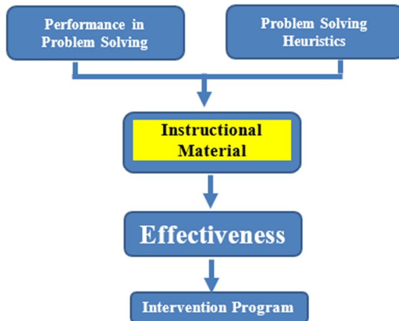
Figure 2. Conceptual Paradigm

The conceptual paradigm shows that the initial performance of the Grade V pupils and the heuristics that they already employ will serve as the basis for the development of instructional material using Algebra as a tool in problem-solving. Post-test will be conducted after the use of the material to determine the effectiveness of the material. Finally, the material will be enhanced based on the result of the study.