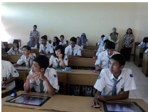
Fig. 3: Learning by applying TPS based on e-learning was begun.

Furthermore, after all the infrastructure and facilities are met, teachers and students are ready to implement learning based on e-learning, then the implementation of mathematics learning through the implementation of TPS based on e-learning can be begun.