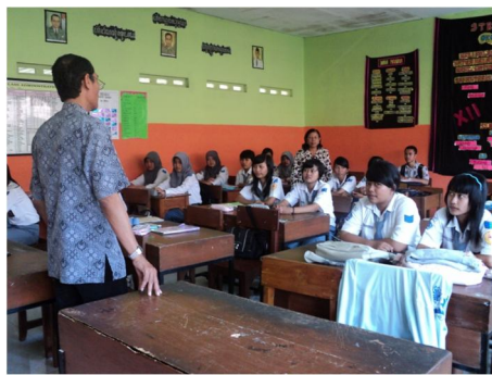
Fig. 2: Students were given an explanation of learning mathematics was taught through the application of TPS based on e-learning

Furthermore, after all the infrastructure and facilities are met, teachers and students are ready to implement learning based on e-learning, then the implementation of mathematics learning through the implementation of TPS based on e-learning can be begun.