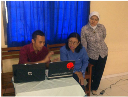
Fig. 1: Teacher partner was trained e-learning.