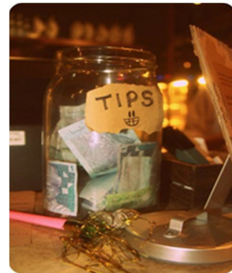
Exhibit 9: The Tip System