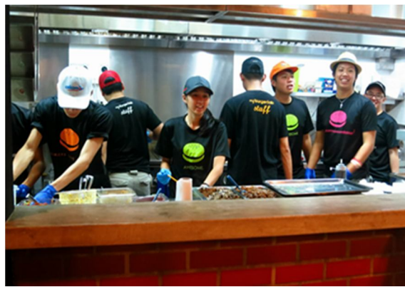
Exhibit 7: The Lab Geeks