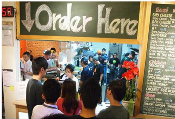
Exhibit 10: The Facilities at the Kitchen of myBurgerLab