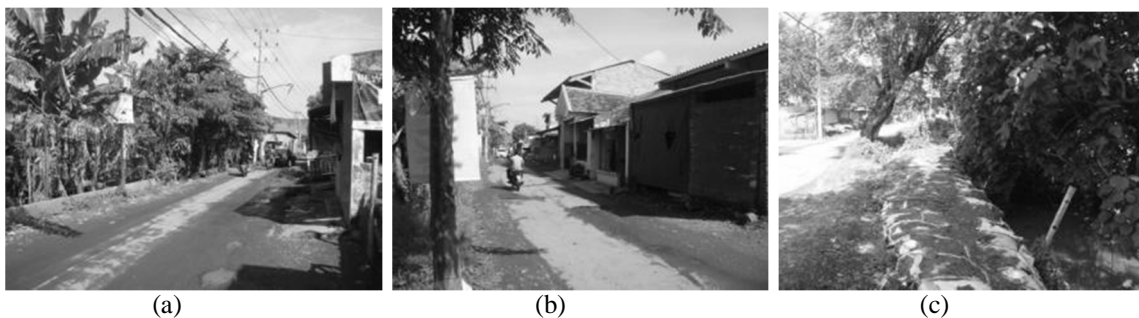
Figure 2 General overview of open space at the riverbank and Main Street of Kampung Wonorejo Timur (Field survey, 2015)

General overview of Kampung Wonorejo Timur can be seen on Figure 2. The left (a) and middle sides (b) of figure describe the atmosphere of Kampong with its main street and buildings. The width of street is approximately 4 (four) meters with asphalt surface material, 1 (one) meter both side as transition space between main street and main building with sand and aggregate surface material. The landuse of Kampong are varying from housing to home-based enterprise. Figure 2 (c) shows the existing condition of riverbank with embankment made of sandbags to prevent flood and high water level.