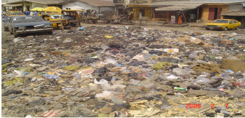
Plate I: Poor environmental condition in Makoko